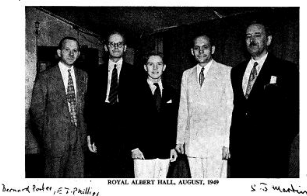
Royal Albert Hall August, 1949

I went to church as usual, expecting the presence and blessing of God, but little realising what a miracle was to take place that night. I went to church expecting the presence of the Lord to come down to bless us, not knowing that during the service I would be taken up to heaven to talk with Him.