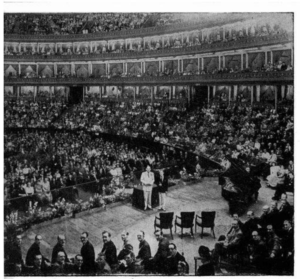
ible seats were filled some time before the opening hymn was sung. When the appeal was given or the vast auditorium, and as the invitation was given the aisles were filled with people coming to hundred were converted in this meeting alone.